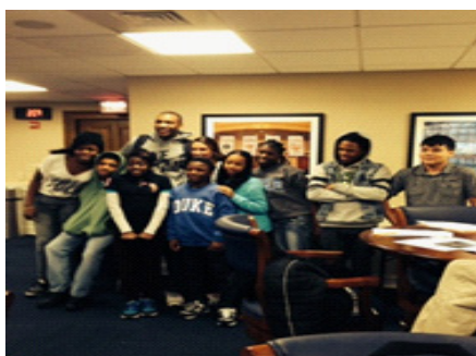
Hart Students in the Legacy Room at Duke (2014)