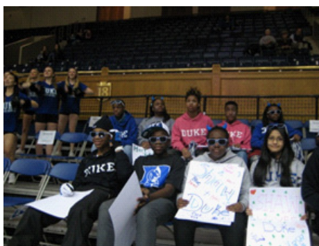
Shaw and Hart Students watching Duke Women's Basketball Game (2013)