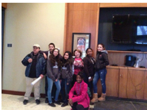
Loiederma Students at Johns Hopkins University (2015)